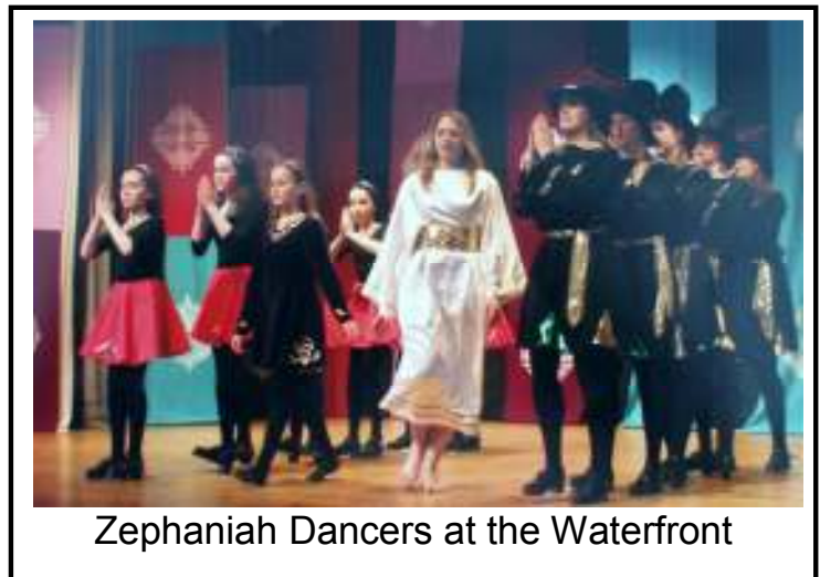
Zephaniah Dancers at the Waterfront

Please contact us with your requirements at 07833714207.♦